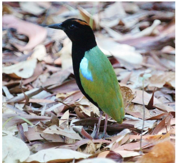
Rainbow Pitta at Howard Springs

October 9, Day 12: Travel from Kakadu National Park to Katherine. Today after a visit to the Aboriginal Cultural Centre we will drive 250 kilometers south to the township of Katherine. This ventbird.com